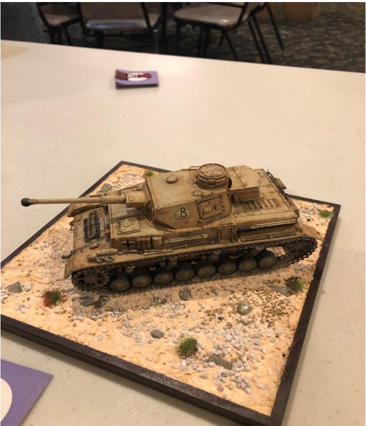
Vince D'Allesio's PzKw IV