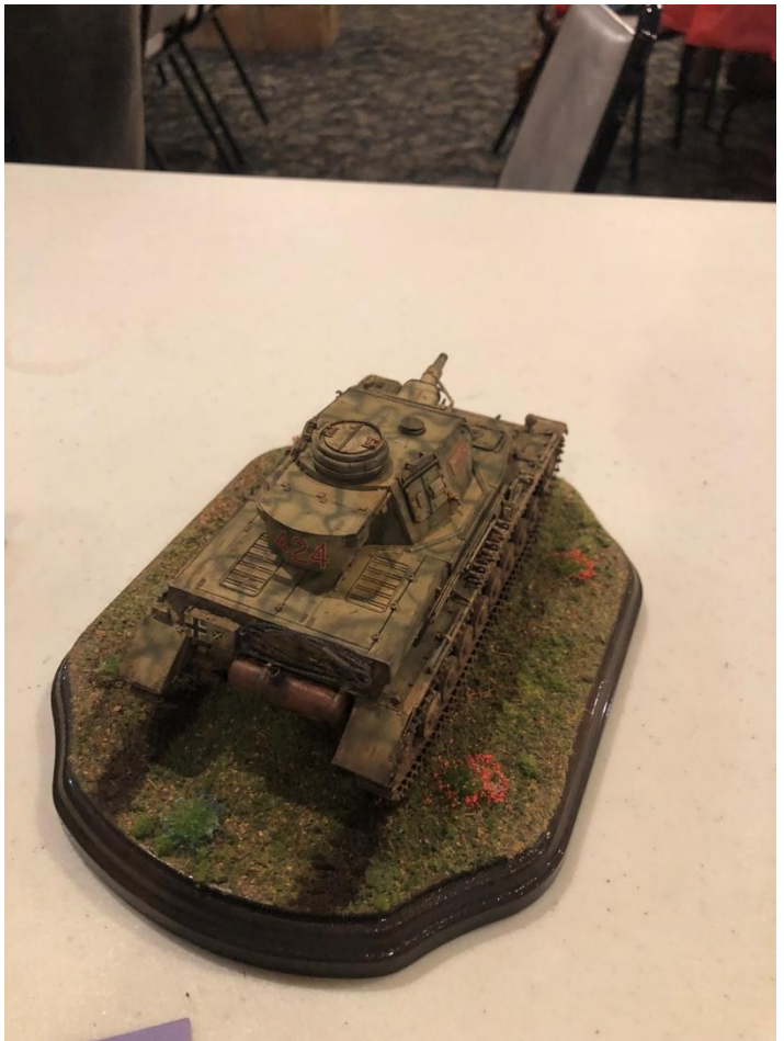
Vince D'Allesio's PzKw IV