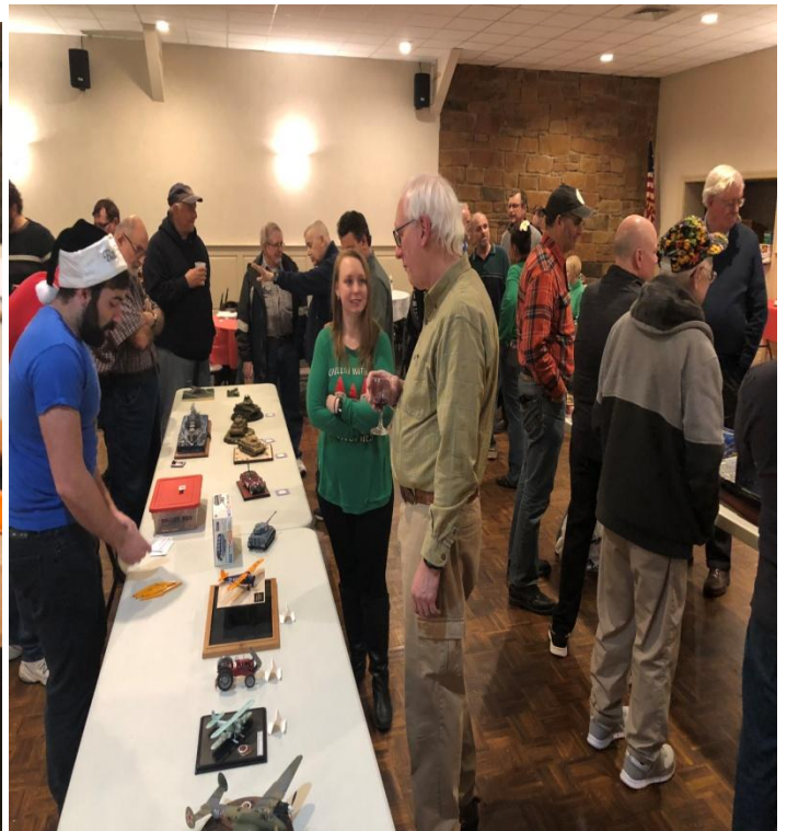
A great night!